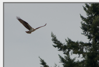
Neighborhood peregrine falcon

http://thelarkexperience.com/ http://thelarkexperience.com/chron/