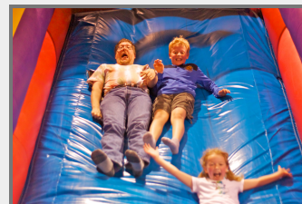
I'm sorry, but that slide is scary

Merry Christmas. Happy Holidays. Pleasant Winter Solstice. Season's Greetings. Happy Festivus. Happy Hanukkah. Give An Atheist Kid A Gift For No Reason.