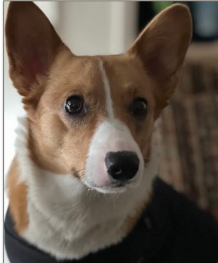
Tiabeanie ("Beanie") looking all dignified